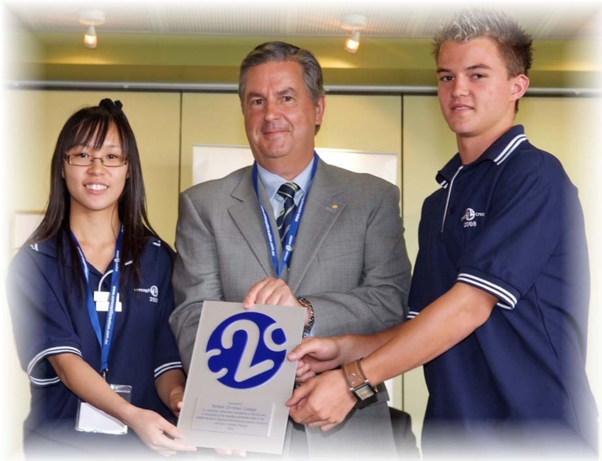
The NAMIG patron His Excellency Rear Admiral Kevin Scarce AC CSC RANR Governor of South Australia with students at the November 2008 C2C Expo